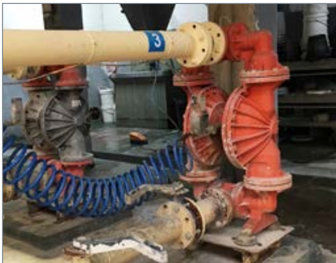
Wilden Chem-Fuse IPDs provide a reliable, efficient and safe solution for improved diaphragm performance, even in the harshest fluid-transfer applications.