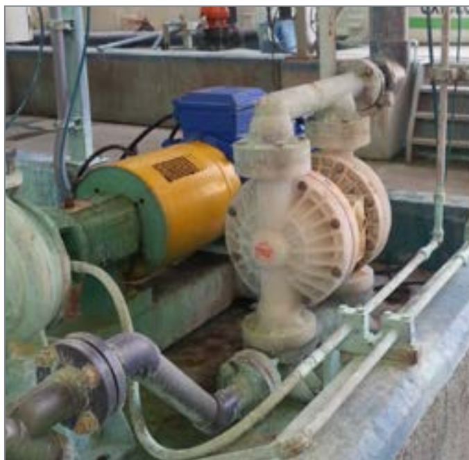
Traditional diaphragm designs feature inner and outer plates that connect the diaphragms to the pump shaft. While this design does have its operational benefits, there are some shortcomings that can lead to the creation of leak points that can affect product containment, which is especially critical when handling dangerous or hazardous materials.

Taking into account the problems that abrasion wear and material buildup can cause, the industry worked diligently to develop the integral piston diaphragm, or IPD. Within the IPD design, the piston that is used to move the diaphragm laterally during the pumping stroke is encapsulated into the interior of the diaphragm itself. IPDs also have a smooth finish with an angle of operation that enhances fluid flow and suction lift while reducing the propensity for material buildup on the outer piston.