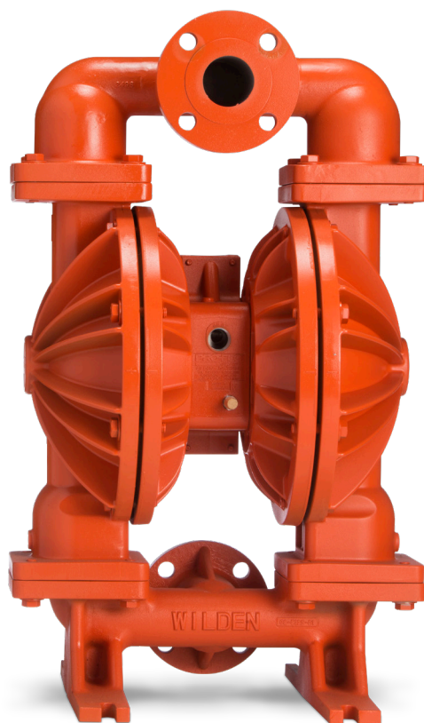
Wilden® 51 mm (2") Pro-Flo® SHIFT Series Bolted Metal AODD Pump

Any type of diaphragm pump can only develop a certain amount of head pressure, or "pressure energy" that is needed to move a fluid from one place to another. The more efficient the piping and pump system are, the more the "pressure energy" can be used to actually move the fluid. If the piping