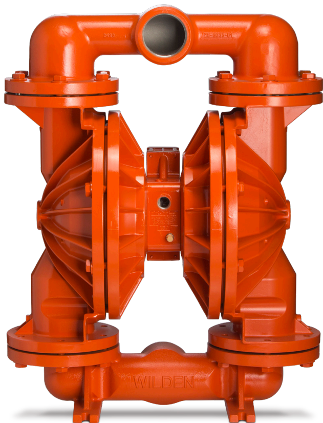
Wilden® 76 mm (3") Pro-Flo® SHIFT Series Bolted Metal AODD Pump

These advanced pumps can also feature a bolted configuration that ensures total product containment, while a variety of elastomers are available to meet abrasion, temperature and chemical-compatibility requirements. Advances in air-distribution systems also help to increase the efficiency of these pumps, no matter the application.