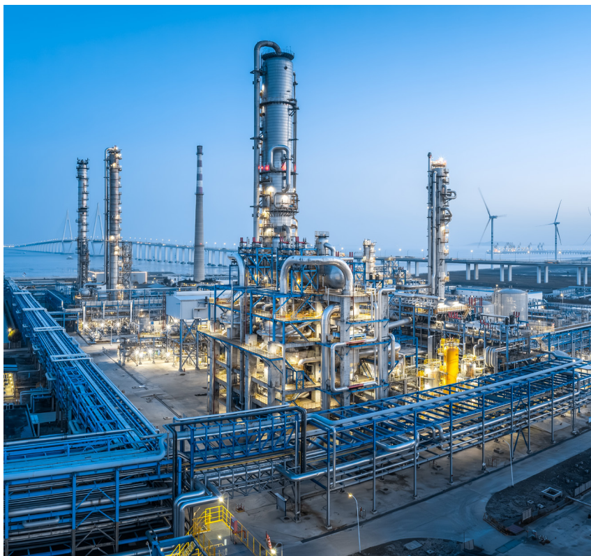
AODD Pumps have long been reliable performers in a wide range of industrial pumping applications. The new Pro-Flo® SHIFT from Wilden® takes that reliability to an all-new, cost-optimizing level.

Most recently, a new generation of ADS has attempted to eliminate overfilling in AODD pump operation. This next-generation ADS technology claims to prevent overfilling by cutting off the air supply to the air chamber before the end of the pump stroke. There are two shortcomings, however, in this approach. First, this ADS technology is electronically monitored and controlled, rather than mechanically actuated, which raises an entirely different set of energy usage, maintenance and operational concerns. Second, this electronic ADS technology requires time to "learn," meaning that every time the pump is turned on, the electronic system needs a "learning period" of 30-40 seconds, where it monitors the operation of the pump before it can estimate when to cut off the air supply prior to the end of the stroke. This can result in erratic and inconsistent flow rates for up to 40 seconds and a corresponding waste of air, a drawback that is compounded in dosing operations that feature constant on-off cycles.