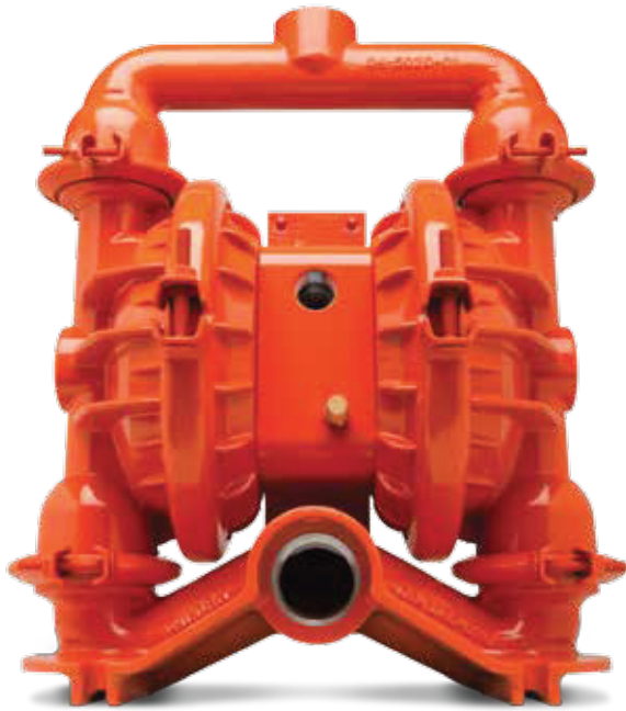
Wilden® PS4 Series Pump