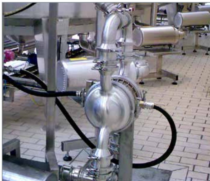
Wilden® Saniflo™ Hygienic™ Series (HS) and FDA AODD Pumps offer a number of operational benefits that make them better suited for soft-drink production than centrifugal pumps, including seal-less design, dry-run capability, shear-sensitivity and higher energy efficiency.