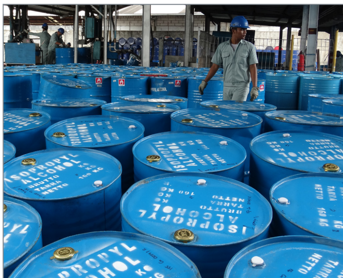
The sheer volume of solvents that IndoChem handles annually made the need for a more efficient pump a critical consideration.