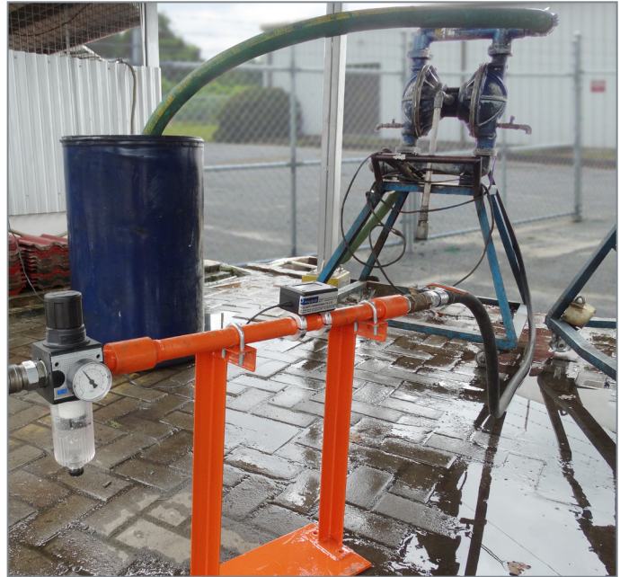
An on-site, head-to-head test at the IndoChem facility unequivocally illustrated that a Wilden® Bolted Series AODD Pump outfitted with the Pro-Flo® SHIFT ADS shortened loading times while cutting air consumption (competitor pump shown).