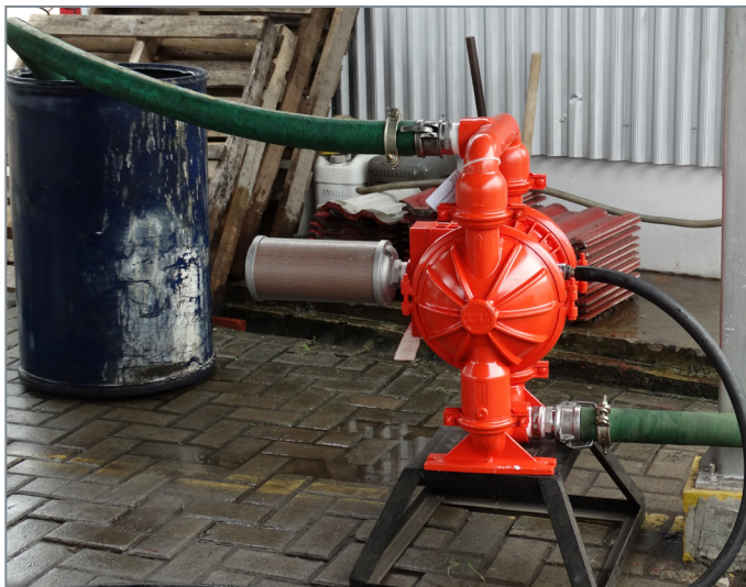
Installing the revolutionary Pro-Flo® SHIFT ADS on a Wilden® Bolted Series AODD Pump gave IndoChem the flow rates, air consumption and product-containment capabilities that it requires in its solvent-handling operations.

To facilitate the transfer of solvents, Juardi utilizes a total of 60 pumps between his three manufacturing facilities. He had been strictly relying on a single brand of AODD pump, but over time he had come to find the pumps unreliable