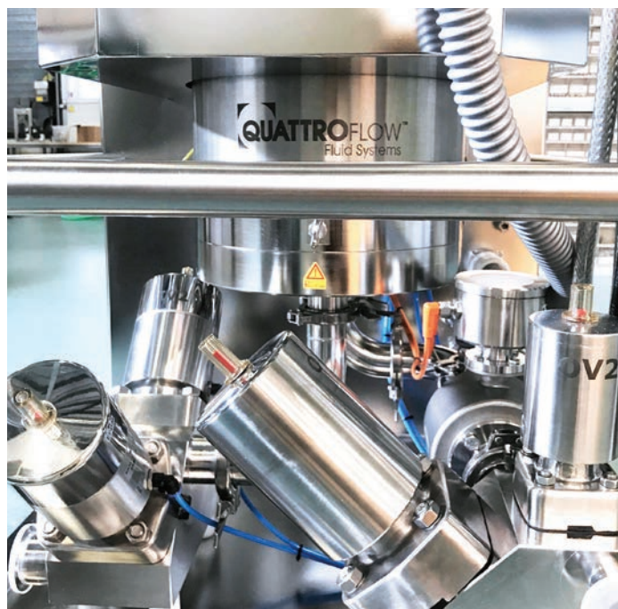
An HP-RFC column that is properly packed with resins enables better separation and resolution of the target proteins. Playing a critical role in the resin-packing process, due to their sensitive handling of the delicate or rigid resins, are Quattroflow™ Quaternary Diaphragm Pumps.

“Proper column packing has a direct result on the performance of the column,” said Groenewegen. “A well-packed column contributes directly to the separation and efficient capture of the intended product. So, the better the resins are packed, the better the separation and the better the resolution of the targeted proteins.” Properly packing a column, however, is oftentimes easier said than done.