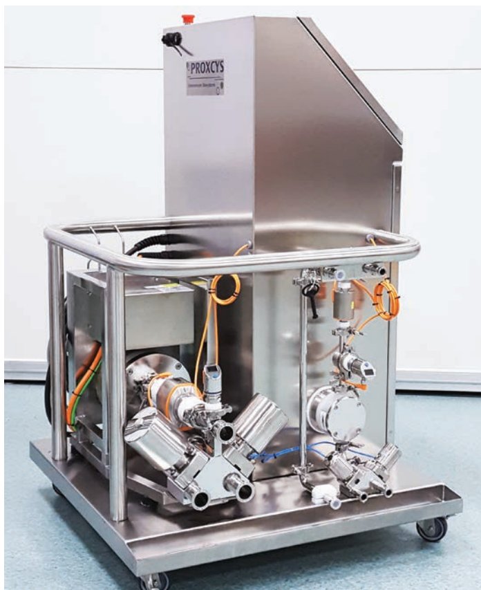
A PROXCYS HP-RFC skid places all of the system's components, including the Quattroflow™ Quaternary Diaphragm Pump, on one easy-to-maneuver cart. This lightweight solution allows the cart to be readily moved wherever it is needed in the biologic-production process.

On the other hand, RFC, which was actually invented in the 1950s, offers increased throughput and reduced pressure drop, while the system's weight and footprint can be one-quarter that of the axial-flow columns. As mentioned, unlike axial-flow systems where the liquid stream passes through the chromatography media vertically, RFC sees the media wrapped around a central cylinder, with the liquid stream passing through it horizontally via the application of positive pressure. RFC essentially folds the horizontal bed of the axial system