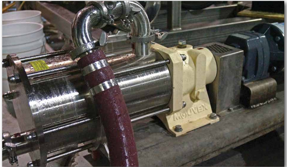
The Mouvex® C-Series eccentric disc pump helps Surly Brewing maintain consistency and quality by protecting yeast, proteins and malts against shearing.