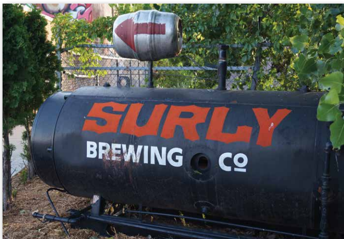
Surly Brewing is one of the fastest growing craft brewers in the Midwest, USA, with business increasing 32 percent from 2009 to 2010 alone.