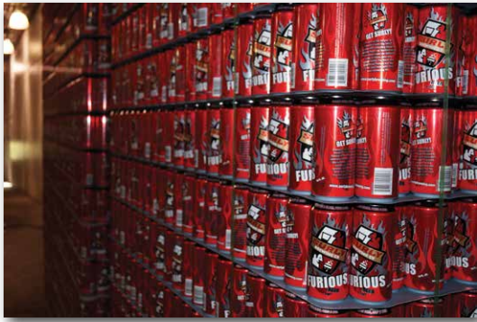
Furious, Surly Brewing's top-selling beer, will be available on tap when Surly opens its new brewpub in 2013.

up 32 percent from 2009 to 2010) that it was too big under Minnesota law to sell beer on its premises as a micro-brew. Surly was producing between 15,000 and 20,000 barrels a year—over four times what the law allowed to be classified as a small micro-brew. Overcoming an initial rejection at the Capitol, Ansari's lobby efforts—along with an extensive social media campaign by fans of Surly Brewing and other breweries—achieved the passing of the "Surly Bill" in 2011, allowing larger breweries to sell pints of their product onsite.