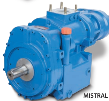
MISTRAL 420 - 750 m 3 /h