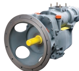
SAE 4 Flange