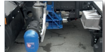
Low-Space, Direct-Driven, Non-Cooled Systems