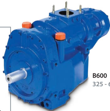
B600 325 - 600 m 3 /h