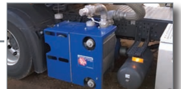
(Suction + Pressure) Direct-Driven, Inter-Cooled Systems