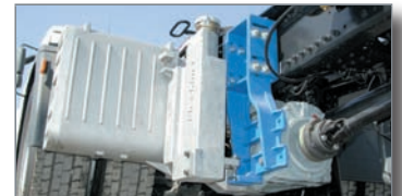
Direct-Driven, Non-Cooled Systems