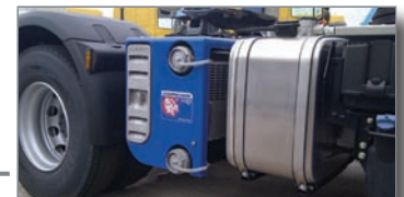
Direct-Driven, Inter-Cooled Systems