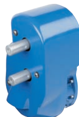
13R - 15L 19R - 22L* Multipliers