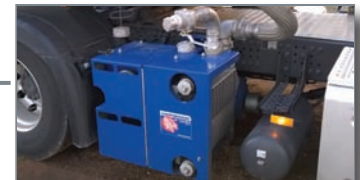
(Suction + Pressure) Direct-Driven, Inter-Cooled Systems