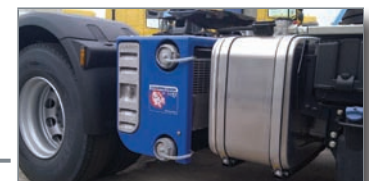
Direct-Driven, Inter-Cooled Systems