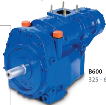
B600 325 - 600 m 3 /h