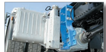
Direct-Driven, Non-Cooled Systems