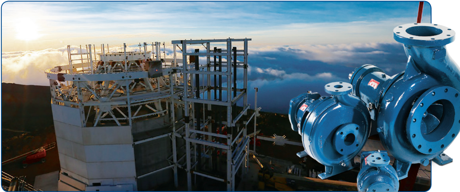
The Daniel K. Inouye Solar Telescope (DKIST) under construction on the Haleakalā volcano summit in Maui, HI, will provide the sharpest views ever taken of the solar surface, but requires precise thermal control of its dome exterior, which will be provided by Griswold 811 Series Centrifugal Pumps.