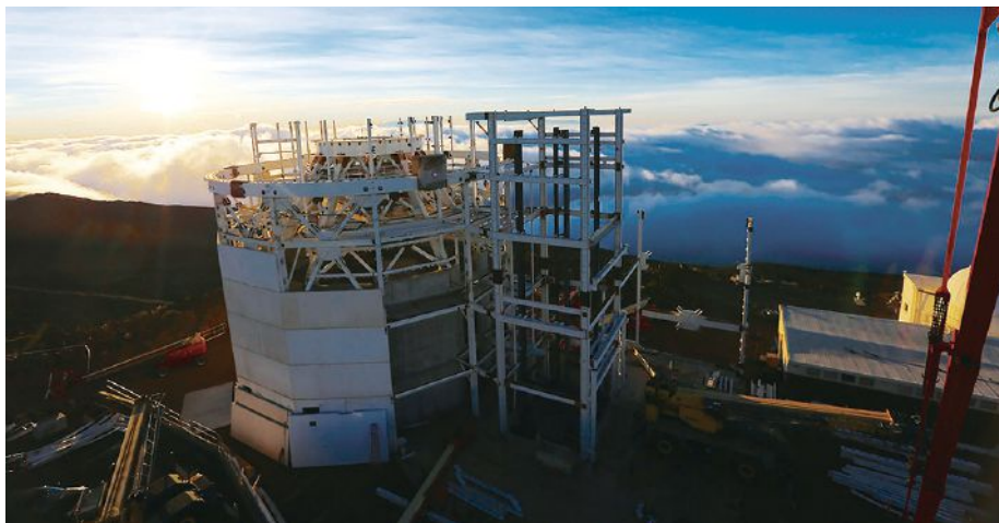
The Daniel K. Inouye Solar Telescope (DKIST) under construction on the Haleakalā volcano summit in Maui, Hawaii, will provide the sharpest views ever taken of the solar surface, but requires precise thermal control of its dome exterior, which will be provided by Griswold 811 Series Centrifugal Pumps.

To meet this important need, the National Solar Observatory (NSO) is constructing the Daniel K. Inouye Solar Telescope (DKIST) at an elevation of 10,000 feet on the Haleakalā volcano summit in Maui, Hawaii. NSO is funded by the National