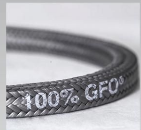
GFO is a registered trademark of WL Gore and Assoc.