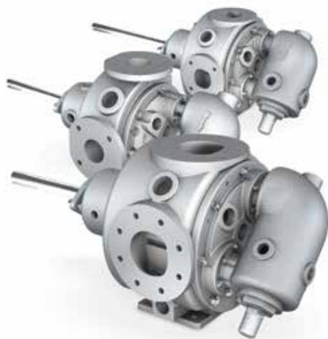
EnviroGear® V Series Internal Gear Pumps feature a series of design enhancements that make them ideal for handling asphaltic products with a wide range of temperatures and viscosities. These include a large jacketed surface on the pump case and pressure relief valve, jacketing behind the pump rotor, a rotatable casing and high-strength, ductile-iron gear material.

The design of the V Series pumps also builds on the features of EnviroGear's other best-in-class