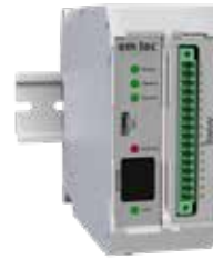
NEW SERIES: BioProTT™ FlowMCP-a