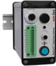
EXISTING SERIES: BioProTT™ FlowTrack DINrail