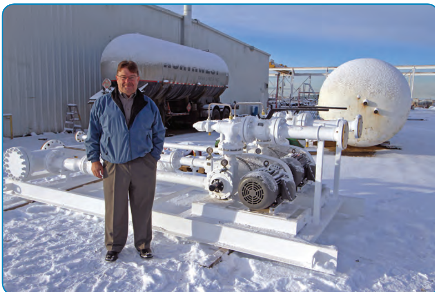
Blackmer pumps and compressors are the preferred choice for nearly all of MaXfield’s designs.

On the compressor side, MaXfield relies on Blackmer’s LB Series Reciprocating Gas Compressors, specifically the LB361 and LB601 models. LB Series compressors feature a ductile-iron head that is stronger and more resistant to thermal shock and corrosion than ordinary cast iron, resulting in long-life reliability. Leak-free operation is ensured by the presence of O-rings, instead of