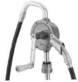
BR & BRF: Standard and FM-approved Transfer Pump with Discharge Hose, Nozzle & 40" Suction Pipe