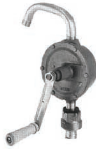
AT: Standard Dispensing Pump with Discharge Spout & 40" Suction Pipe