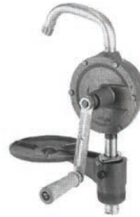
DPF: FM-approved Dispensing Pump with Drip Pan, Discharge Spout & 40" Suction Pipe