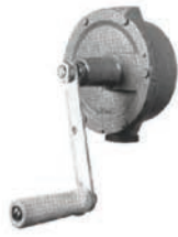
PA: Basic Pump for In-line Installation