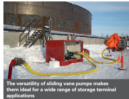
The versatility of sliding vane pumps makes them ideal for a wide range of storage terminal applications