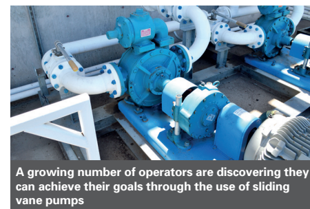
A growing number of operators are discovering they can achieve their goals through the use of sliding vane pumps

ring liquids from one storage tank to another, the operation of sliding vane pumps can also make them a first-choice technology for other common storage activities. These include the blending, mixing and packaging of raw materials or end products, which can then be loaded onto transport vehicles for further shipment down the supply chain.