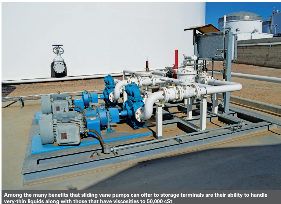
Among the many benefits that sliding vane pumps can offer to storage terminals are their ability to handle very-thin liquids along with those that have viscosities to 50,000 cSt