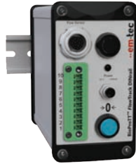
EXISTING SERIES: BioProTT™ FlowTrack DINrail