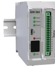
NEW SERIES: BioProTT™ FlowMCP-a