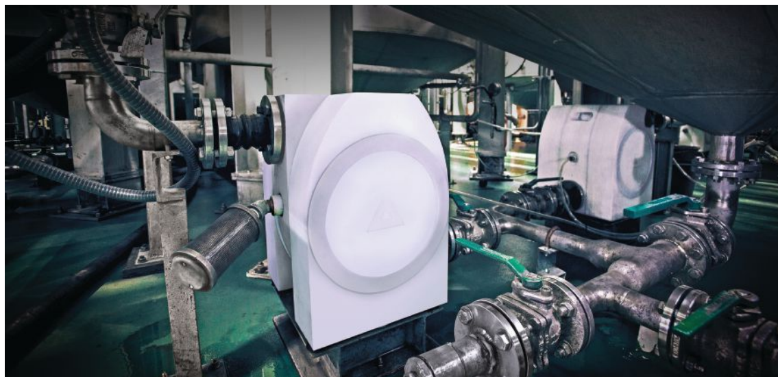
Air-operated double-diaphragm (AODD) pumps provide technology for rugged in-the-field applications that require the safe and efficient transfer of everything from solid-laden slurries to corrosive, abrasive and even explosive materials.

restarts when the pressure drops – without regulation or monitoring via mean supply response time (MSRT) devices