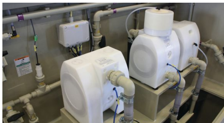
The design of Almatec E-Series AODD pumps features an optimized flow pattern that allows them to offer increased pumping capacity while consuming less air, resulting in a more cost-effective pump.

Visit our website www.koboldusa.com or call KOBOLD CANADA 1-888-769-5550