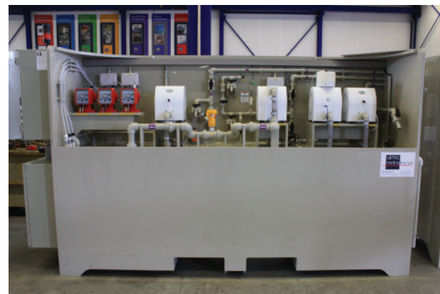
Flux-fluid systems are used to pre-treat raw steel before it is introduced to the hot-dip galvanizing process.

LBTEC INDUfinish's system houses the flux fluid used in the pre-treatment. The system includes four compartments: the first contains the flux fluid; the second mixes the flux fluid with certain chemicals to obtain the correct pH level; the third receives the flux fluid after it passes through a