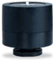
Pulsation Dampeners 3/8" to 3" Stainless Steel, PTFE, PE