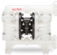
MAX-PASS® 3/8" to 1"