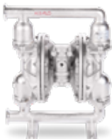
All-Pur™ FDA F-Series 1" to 2"