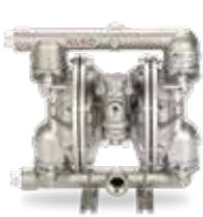
Aluminum / Stainless Steel 1/2" to 3"