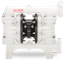
Polypropylene / PVDF 1/4" to 2"

From the smallest to the largest sizes and in the most preferred material types, All-Flo offers a wide range of AODD pumps suitable for various application requirements.