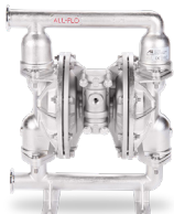
All-Pur™ FDA F-Series 1" to 2"