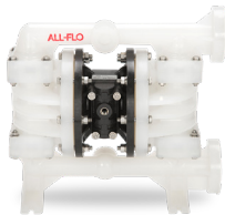
Polypropylene / PVDF 1/4" to 2"

From the smallest to the largest sizes and in the most preferred material types, All-Flo offers a wide range of AODD pumps suitable for various application requirements.