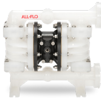
MAX-PASS® 3/8" to 1"