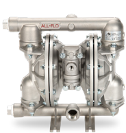
Aluminum / Stainless Steel 1/2" to 3"