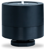
Pulsation Dampeners 3/8" to 3" Stainless Steel, PTFE, PE