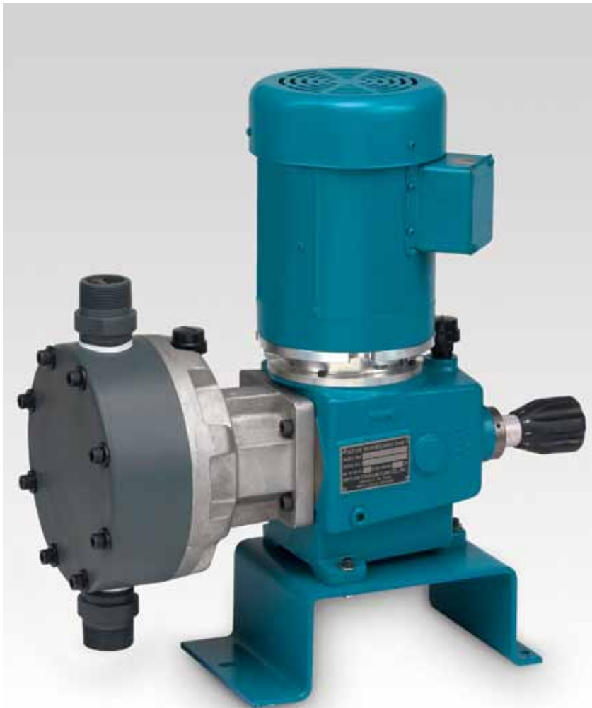
Mechanical diaphragm metering pump