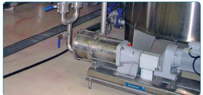
The eccentric-disc pumping principle allows for the gentle transfer of fluids from suction to discharge with very low agitation and shear.

This pump style also maintains excellent volumetric consistency, making it ideal for dosing applications. The pump's seal-free design makes it dry-run capable and eliminates any potential leak or contamination points while providing superior suction lift. Finally, peristaltic (hose) pumps are easy to operate and easy to maintain. The pump's reversible operation allows for pumping in both directions.