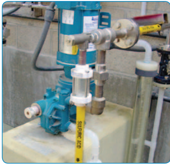
Metering pumps are reciprocating positive-displacement pumps that have the capability to inject liquids at precisely controlled and adjustable flow rates.

are actually reciprocating positive-displacement pumps that can be used for the injection of chemical additives, proportional blending of multiple components or metered transfer of a single liquid. Their design characteristics make these types of pumps desirable for applications that require highly accurate, repeatable and adjustable rates of flow.