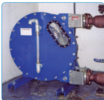
Peristaltic (hose) pumps are effective for a diverse array of applications because their operation moves products at a constant rate of displacement.

The design and operational characteristics of peristaltic (hose) pump technology make it a wise choice in a wide range of applications—from moving viscous and/or abrasive slurries to the transfer of water-thin, non-lubricating fluids, corrosive chemicals and shear-sensitive materials. These characteristics make peristaltic (hose) pumps ideal for such diverse industries as wastewater treatment, chemical processing and food manufacturing.