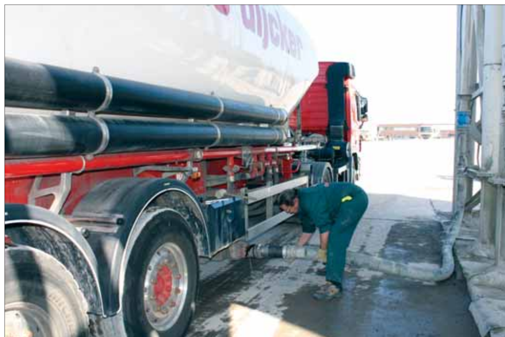
Compared to traditional screw compressors, the MH6 is quieter and generates less heat