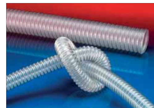
AIRDUC PUR-INOX 351 MHF-AS hose from Norres Schlauchtechnik

Van Beek of the Netherlands is continuing to achieve buoyant sales of its rubber-tyred Dino bulk loaders which provide a clean, fast and safe method for transferring bulk products from sacks or bulk bags directly into road tankers. With this system there is no need for workers to climb on top of the vehicle. Over 350 of these mobile truck loaders have been sold to date and each machine is tailored to suit the requirements of the operator in terms of capacity, dimensions and surface finish (food-grade, abrasion-resistant, etc). Units have even been supplied with integral sampling systems.