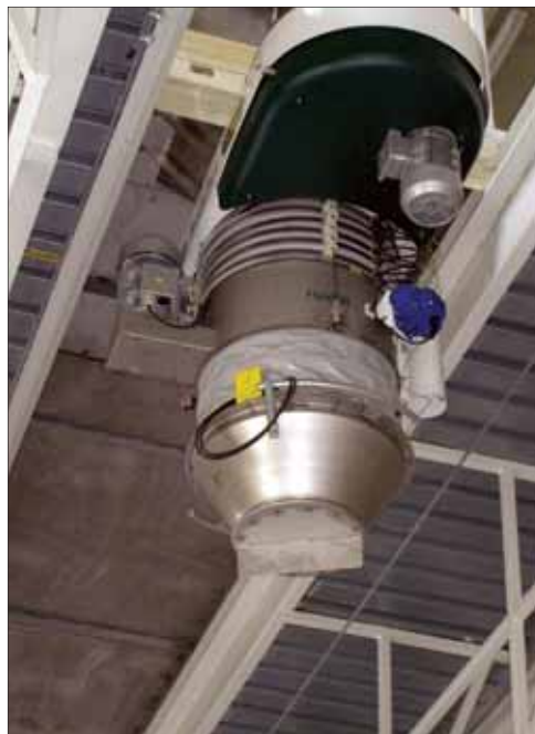
Retractable Moduflex loading chute from Cimbria Bulk Equipment recently supplied to Agrana, Hungary

means that besides ensuring that no foreign bodies can get into the chute when not in use, it prevents residual material dropping out after loading. Furthermore, the chutes are equipped with a FlexVib, a vibrator that is activated after loading has stopped and which considerably reduces residual material in the chute.