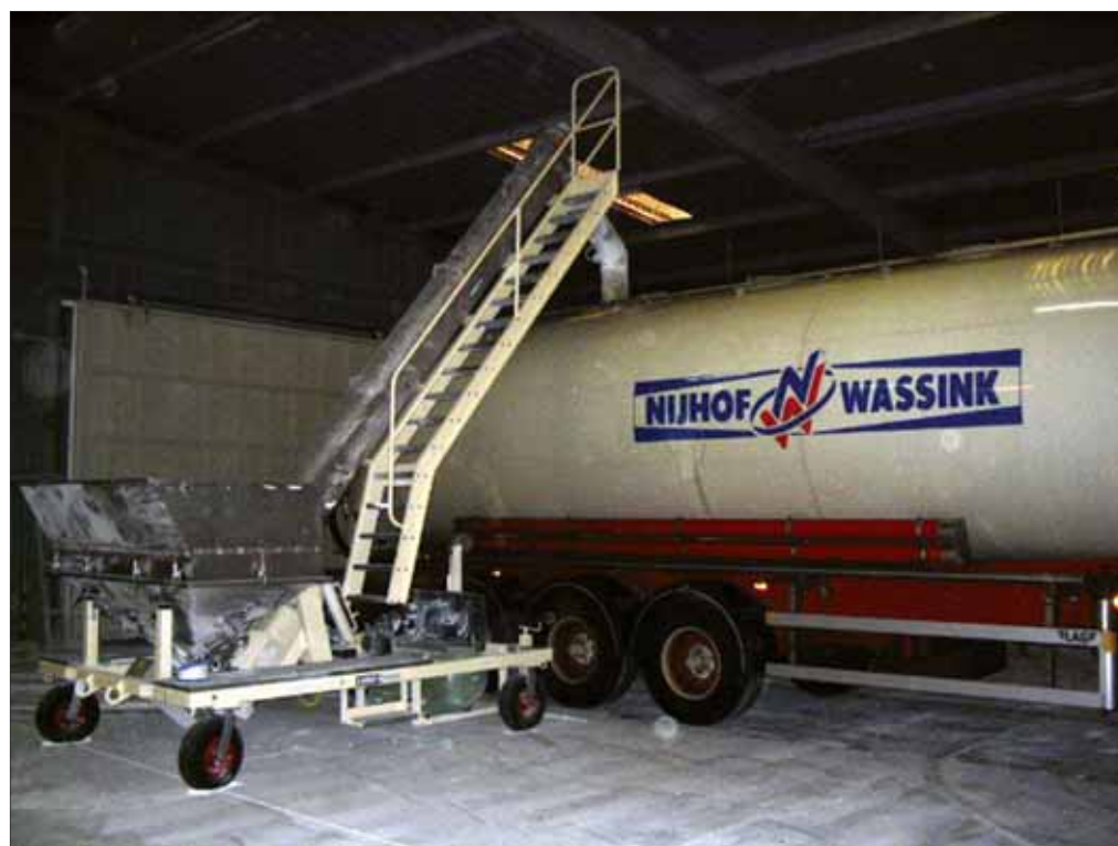
Dino powder tanker loader from Van Beek

Magyar Cukor Zrt, which is part of Agrana, needed equipment for loading sugar into tankers and railcars. The solution was a delivery of two Moduflex loading chutes type S300 in AISI 304 grade stainless steel. The chutes are equipped with food-grade modules, and as the product has a high risk of explosion, the chute is configured for ATEX zones. The chute outlet is equipped with a FlexFill which on one hand optimises filling by spreading the material inside the tanks and on the other hand also functions as a closing cone, which